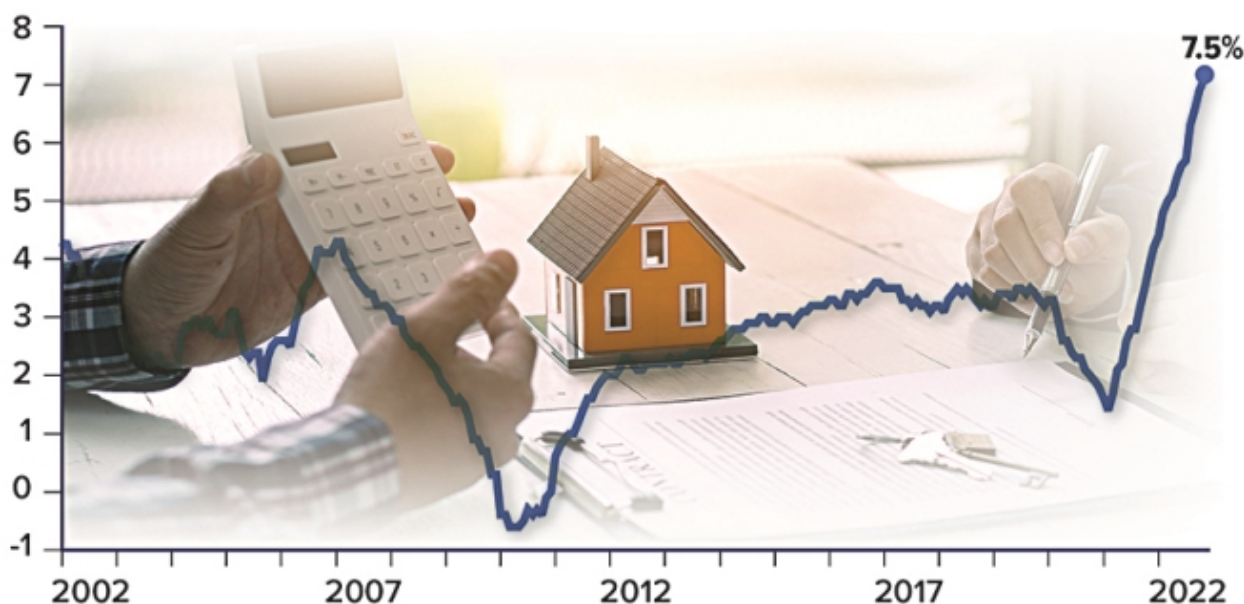
12-month change in shelter costs (CPI-U)