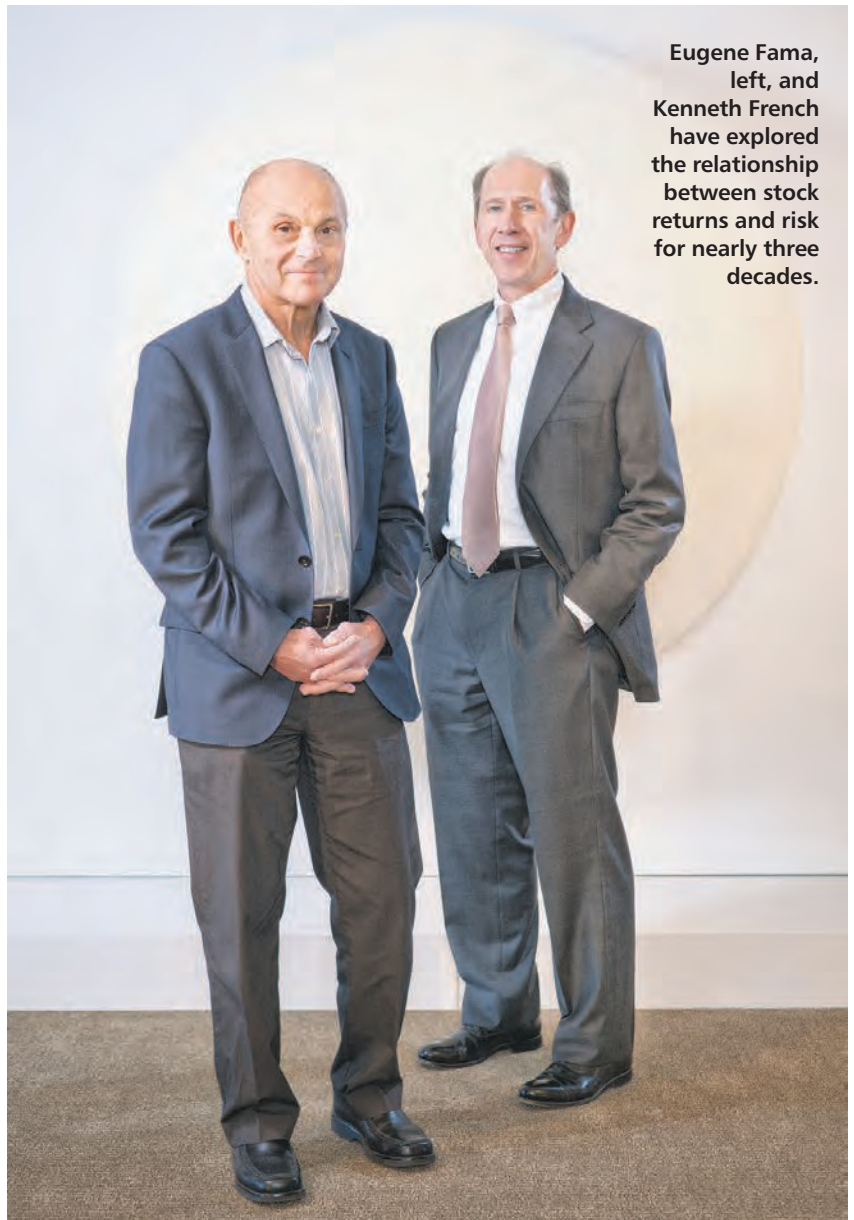
Eugene Fama, left, and Kenneth French have explored the relationship between stock returns and risk for nearly three decades.

The basics of market efficiency are often misunderstood. Some say that if factors such as a stock's value, size, trading momentum, and profitability—all of which are part of your multifactor model—indicate outperformance, then the market isn't really efficient.