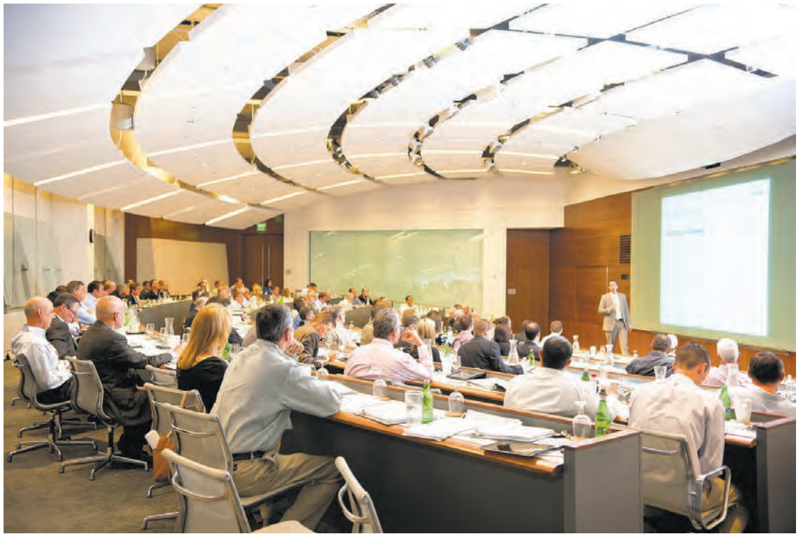
More than 100 advisors came to Dimensional's Austin, Texas, headquarters for two days of seminars.

Advisors selling DFA funds have monthly or quarterly meetings with one another, facilitated by a DFA manager, to discuss portfolio and practice manage-